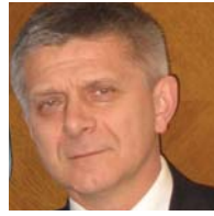
Executive Secretary Marek Belka